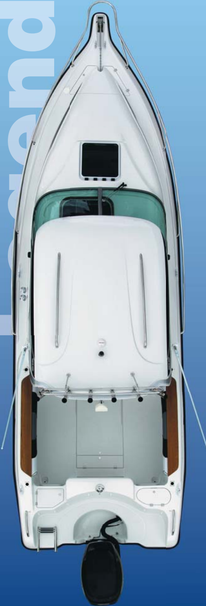
Models shown may include optional accessories

Overall length ..... 7.7m / 25ft Beam ..... 2.45m / 8ft Weight (approx) ..... 2780kgs Outboard Length..... 25" Hull degree ..... 23° Fuel capacity ..... 300 litres Water capacity ..... 75 litres Recommended hp..... 205-400