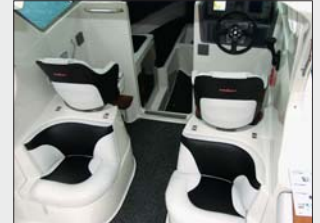
Huge dual underseat storage space for dive gear and tanks.